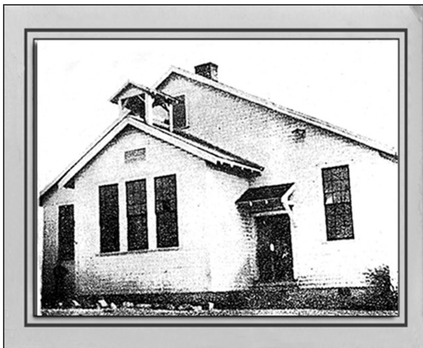
Lamasco School, the TWO ROOM SCHOOLHOUSE